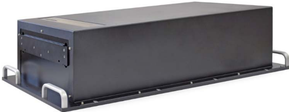
X-ray TDI camera C15400-30-50A