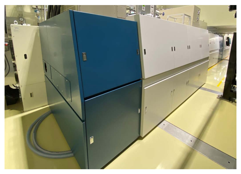
Fig. 3 External view of 250-joule industrial pulsed laser