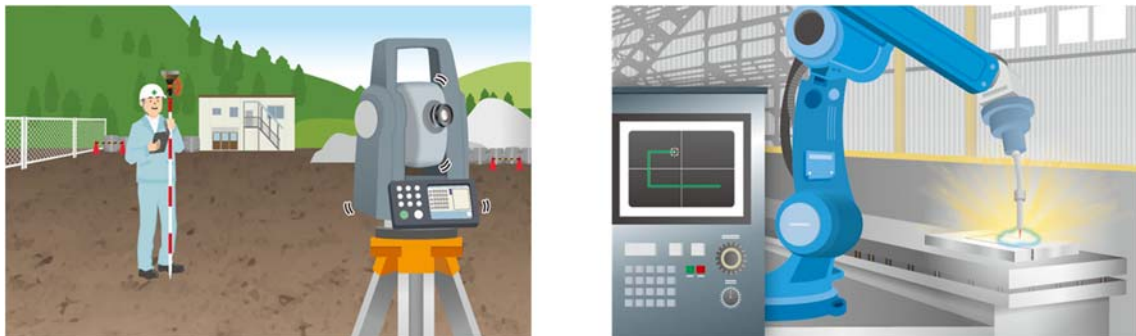
Applications of this new profile sensor

We will be working to expand sales of this new profile sensor and open up a vast new range of applications.