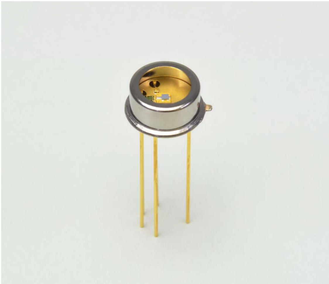
InAsSb photovoltaic detector with preamp P16702-011MN