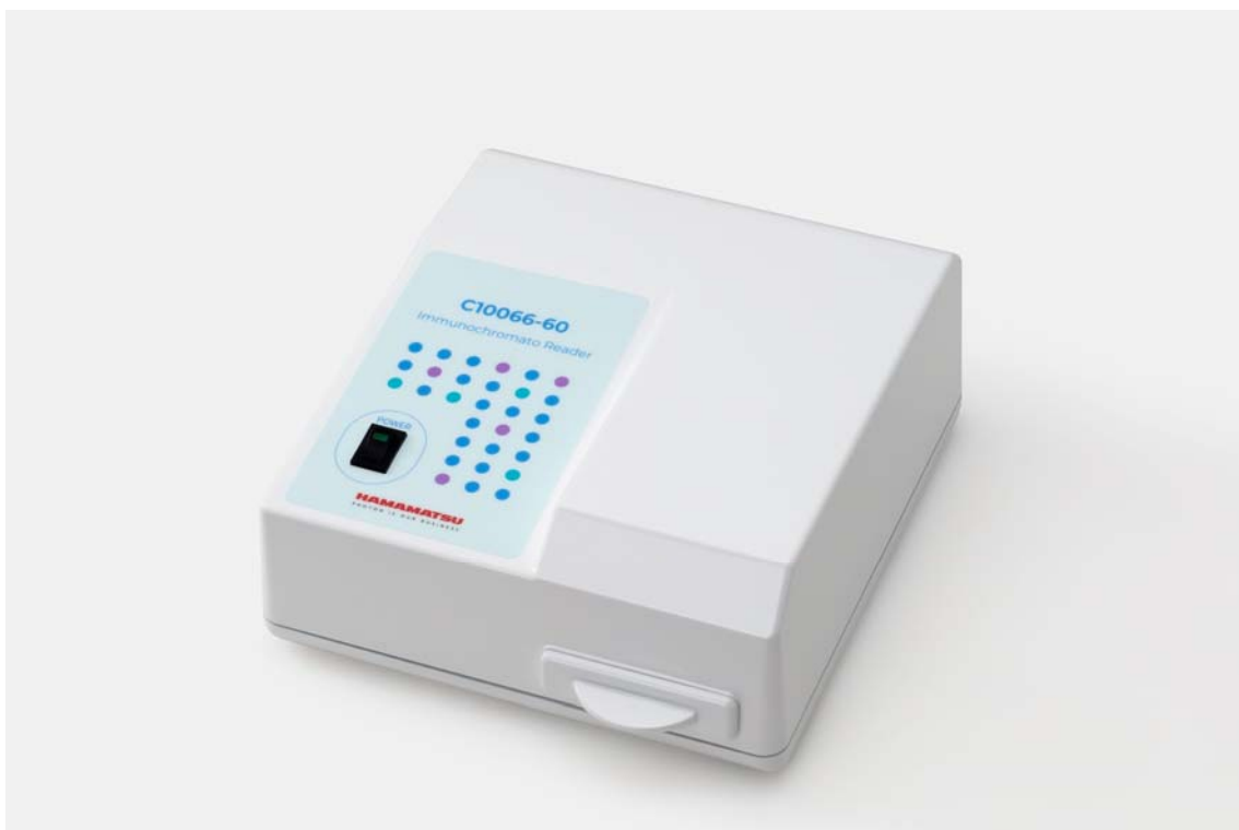
Immunochromato Reader C10066-60