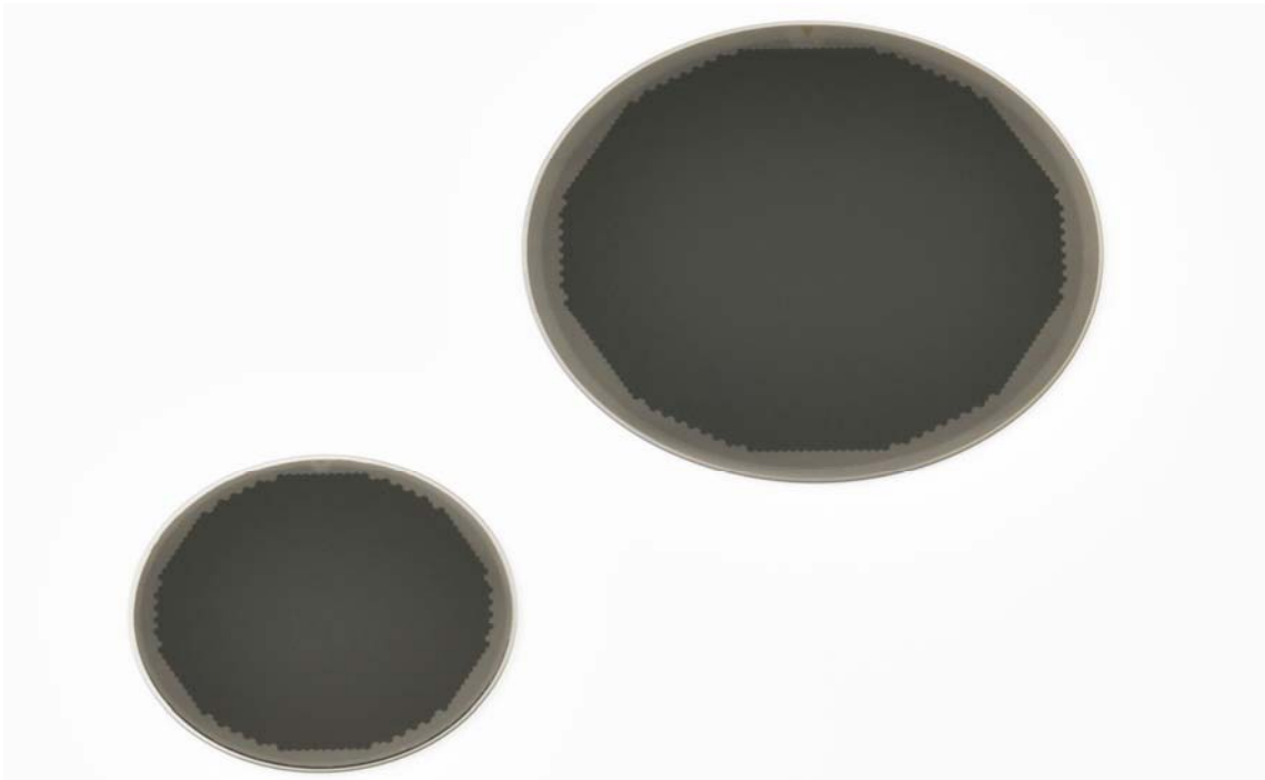
ALD-MCP containing no lead