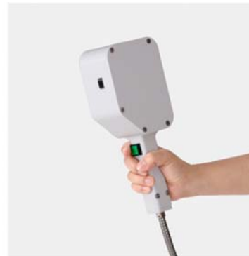
(Left) Measurement using previous product (Right) Handy probe head of C16356