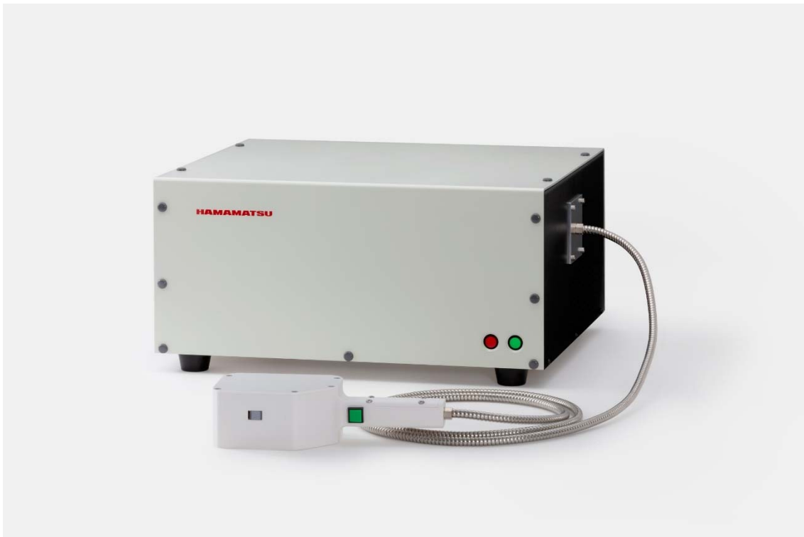
Handy Probe Terahertz Spectrometer C16356