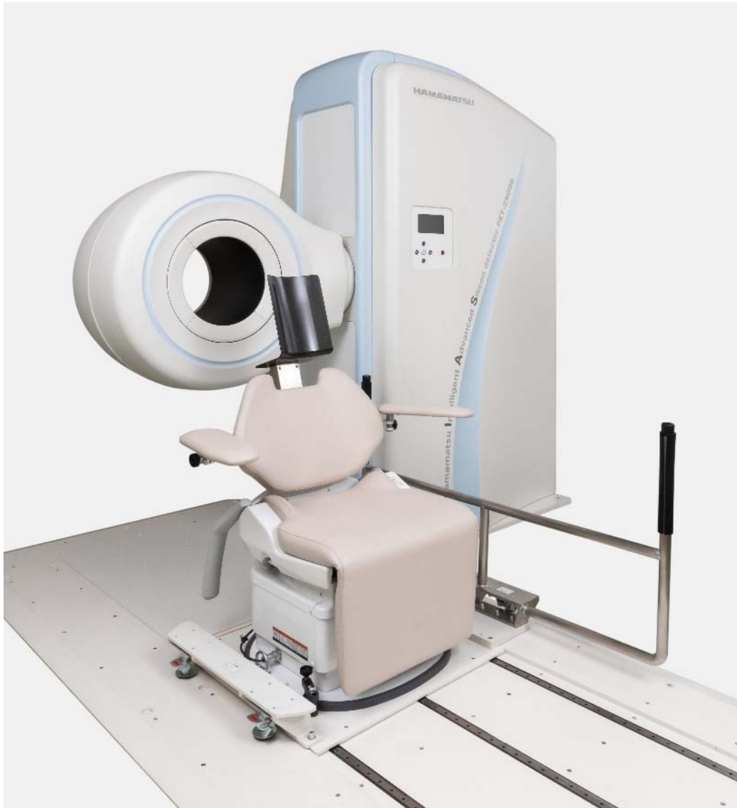
"Brain PET scanner HIAS-29000"