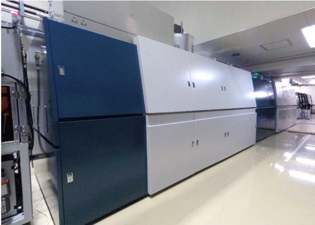
External view of high-energy industrial pulsed laser system