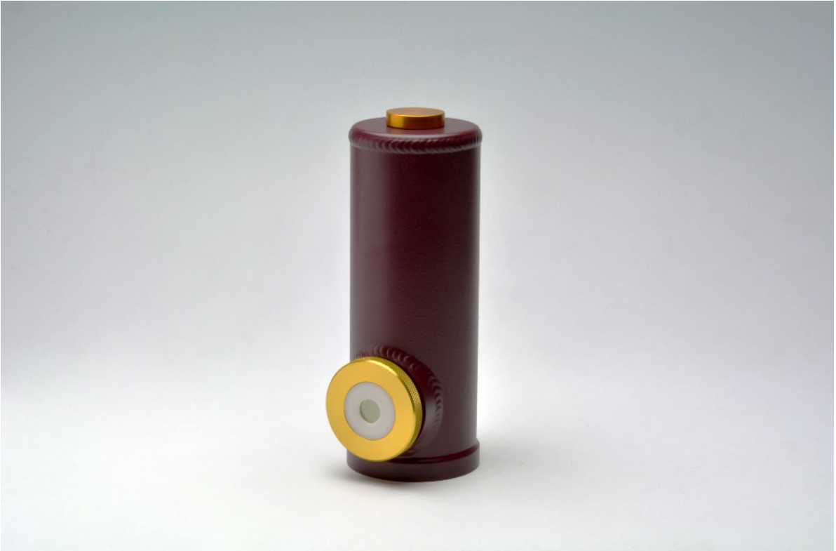
Type-II superlattice infrared detector P15409-901