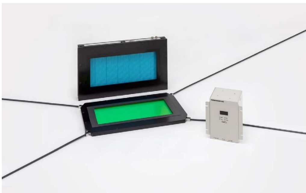
Pinhole inspection unit C15477 (right), light source unit L12057 series (left back) and light collector unit A12159 series (left front)