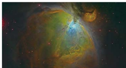
Neutral atoms emitting fluorescence (left) and image of the Orion Nebula (right)