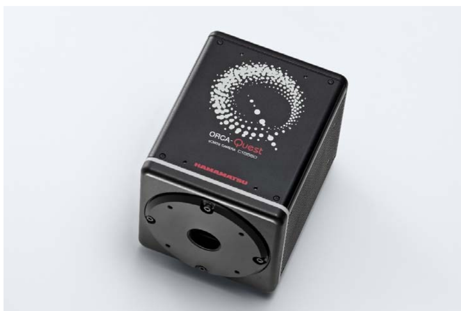
ORCA ® -Quest qCMOS ™ camera C15550-20UP