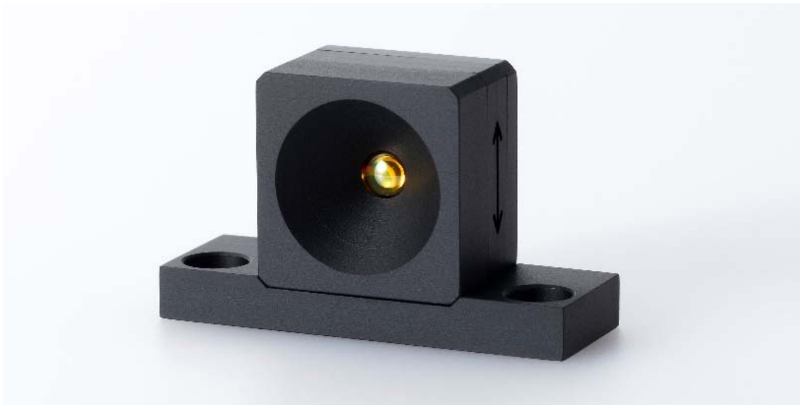
QCD with 20 GHz cut-off frequency